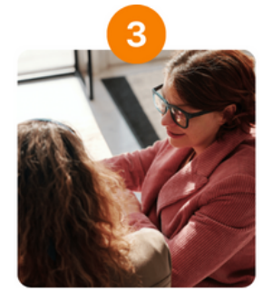
<u>Ask the Experts—Top 5 Tips for</u> <u>Sounds Identity Management</u>