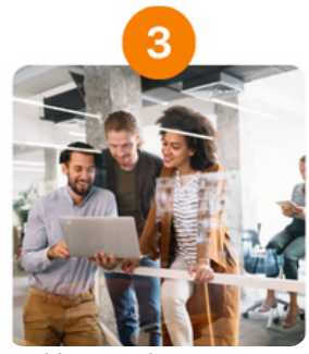
<u>Building a Risk Management</u> <u>Program from the Ground Up</u>