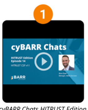
cyBARR Chats HITRUST Edition, Episode 14: HITRUST CSF v11