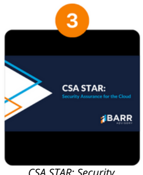
<u>CSA STAR: Security</u> <u>Assurance for the Cloud</u>