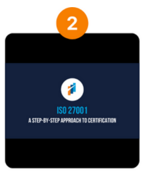
ISO 27001: A Step-by-Step Approach to Certification