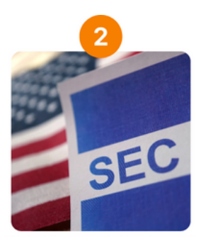
<u>Proposed SEC Cybersecurity</u> <u>Reporting Requirements</u>